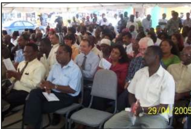
The official opening of the Region 10 Business Centre was also attended by the Prime Minister, Mr. Samuel Hinds

Most recently, LEAP has been looking for workers to assist in the harvest and transportation of produce to Georgetown. Support to land surveying, clearing, drip irrigation techniques, shade cultures and post harvest handling are all ongoing until LEAP comes to a conclusion. However, a decision on the future of the demonstration farm is to be made shortly.