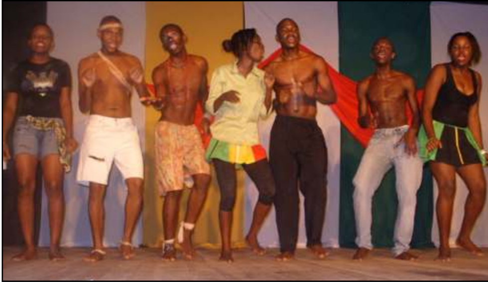
Linden youth performing at LICHAS.....

“Workshop to Production”, produced by the first workshop run at the newly renovated Linden Concert Hall and School, saw a cast of approximately thirty five young people from Linden both as producers and actors. The groups performed in the three disciplines that LICHAS is currently offering training in (singing, acting and dancing). It must be noted that most of the two and a half hour show were the creations of young members of the workshop.