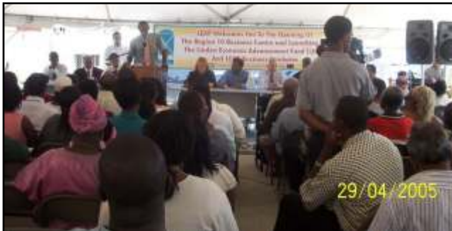
The official opening of the Region 10 Business Centre by HE The President, Bharat Jagdeo in April 2005

LEAP's support in other infrastructure work has not always been readily visible. Among recent achievements was the beautification of the river front, also paths within the markets or the pavement and drains in front of the stalls at Republic Avenue. Major construction work included the road to Moblissa, Haimara Road, creating a second access in and out of the town centre, clearing for the GNIC container terminal, the renovation of the old Guyana stores, now the home of the call centre and LEAP's industrial incubator, and many more.