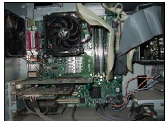
Inside the computer

Recognising the importance of computer-based information and communications services, LEAP has also been providing training for its staff and trainees. For those who wish to further their skills in internet-based activities beyond e-mailing or downloading videos or music to searching for research and business purposes, some useful internet addresses have been included in this newsletter. Please check these tables for the listing of selected national, regional and international websites.