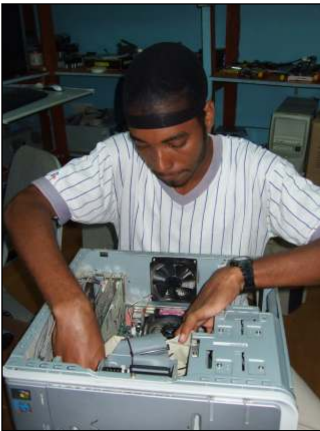
Computer repair by eMax - looks so easy - if you know how

It has almost been a well guarded secret, the true specialists have known it for some time, but now it is public - the Region 10 Business Centre has become a true action centre for those concerned with information technology (IT).