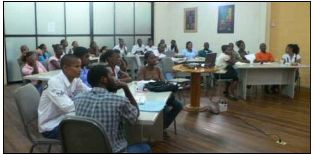
Joint LEAP/Empretec training for Linden youths and young entrepreneurs

The LEAP Business Centre has also attracted established commercial operations, and has successfully been operating the McCaw resource centre.