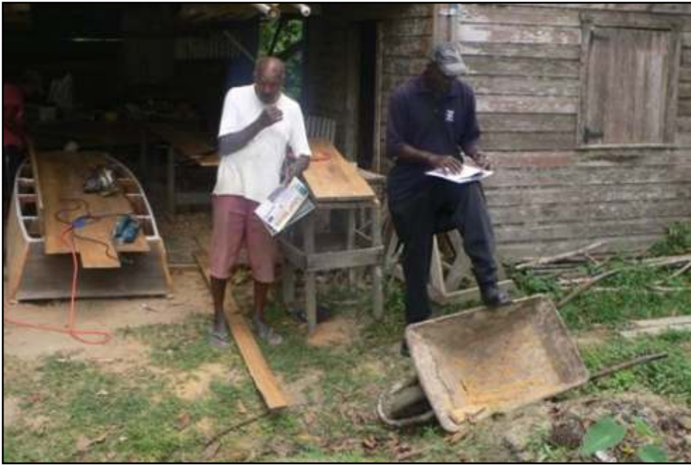
A LEAP interviewer at work to collect data on farms in the Region - please note that the LEAP News is read there as well

With the help of LEAP, commercial farmers in the region will soon be able to grow and produce more in line with market demands. The foundation for this has been laid with a comprehensive survey of commercial farms in Region 10, carried out by LEAP.