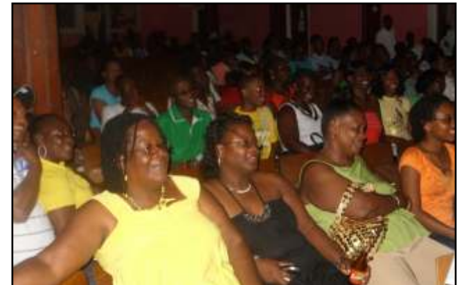
..... And Lindeners are enjoying the great performance at the renovated facilities

Beginning this “term” also will be a number of enrichment seminars for the workshop participants in which resource personnel