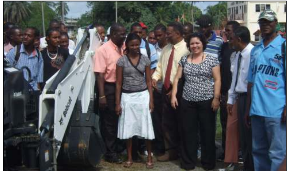
The Prime Minister, Mr Samuel. Hinds, initiating a new training programme for Linden youths