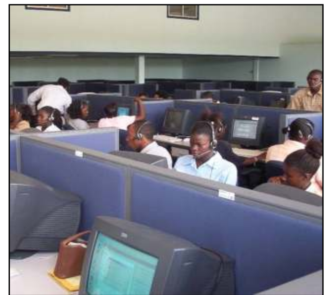
LEAP facilitated the establishment of The Toucan Call Centre, a foreign investor and now a growing Linden employer. The company now works in two shifts.

Ongoing internal monitoring, also confirmed by the most recent external monitoring mission by independent consultants on behalf of the European Commission has shown the LEAP has exceeded most of the original targets. While challenges do remain there is cause to be optimistic that even in these areas these can be overcome with continued support and effort with a LEAP successor.